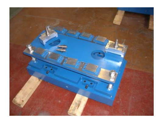
First frame support carriage manufactured and assembled by Liverpool University workshops.