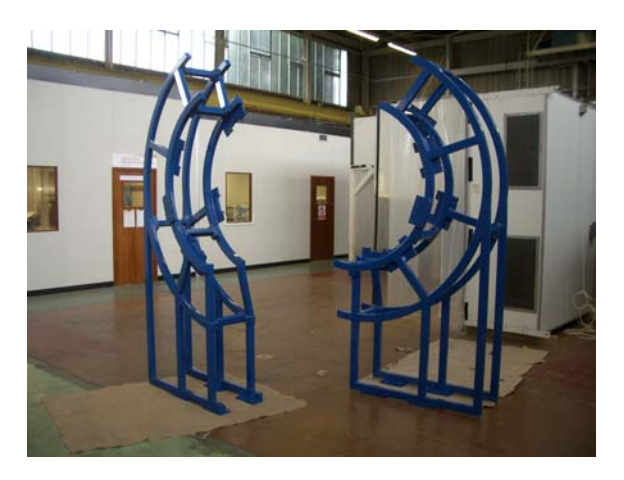
Support frames, supplied by Stan Deans, ready for assembly in the Daresbury assembly area.