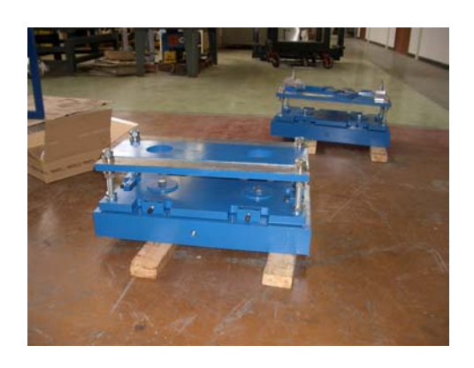
Second Frame support carriage manufactured and assembled by Liverpool University workshops.